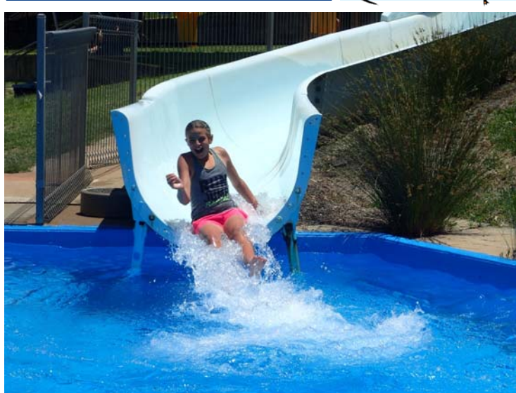
Year 6 Excursion to Narrandera